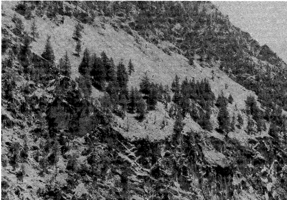
Figure 2. Pinus gerardiana woodland, Sashu site.

Our study sites represent three types of forests described above which occur over pronounced mesoclimatic gradients. They comprise subalpine humid conifer forests of Picea smithiana at Pahlgam (3402 m) and Pinus wallichiana with Abies pindrow at Gulmarg (3505 m), both in the vale of Kashmir, to the lower elevation of subhumid mixed temperate conifer forests of Pinus wallichiana , Abies pindrow , Picea smithiana , and Cedrus deodara at Kistwar (1500 m) and with increasing aridity gradually merges into 'subtropical Pinus roxburghii and ultimately to Pinus gerardiana , Cedrus deodara , and Quercus ilex plant community at Sashu (1800 m) (Figure 2). We emphasised collection of tree cores from Pinus gerardiana and Cedrus deodara growing in inner dry valleys of the northwest Himalaya. The potential exists for longevity in these trees based on published information. These trees generally attain a great girth ( Pinus gerardiana 2-4 m and Cedrus deodara 9-11 m) with a moderate rate of growth (5 rings/cm). For example, a Cedrus tree growing at Kunwar has